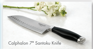
Calphalon 7" Santoku Knife

If you include a Calphalon Kitchen Electrics item on your registry, we'll upgrade your gift to a Calphalon 7" Santoku Knife (a $29.99 value).