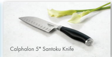
Calphalon 5" Santoku Knife

For $500 or more of qualifying Calphalon products and receive a Calphalon 5" Santoku Knife (a $19.99 value) as our gift to you.