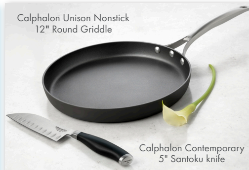
Calphalon Contemporary 5" Santoku knife

Fill out the form below. Circle qualifying Calphalon items on your official wedding registry sheet. Enclose both in an envelope and mail to: Calphalon Corporation Gift Registry Department, P.O. Box 657, Toledo, OH 43697-0657